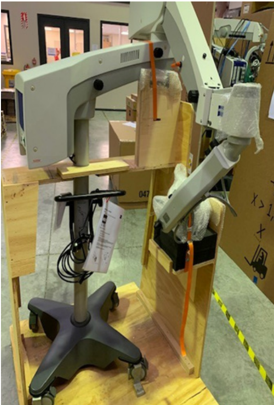
The Ear Nose and Throat (ENT) microscope being packed and made safe for shipping in Auckland.